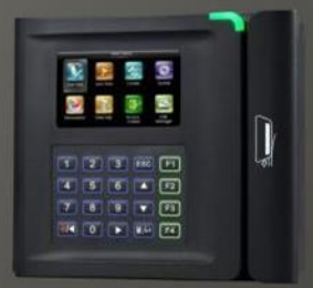
TM15C-B Barcode card reader